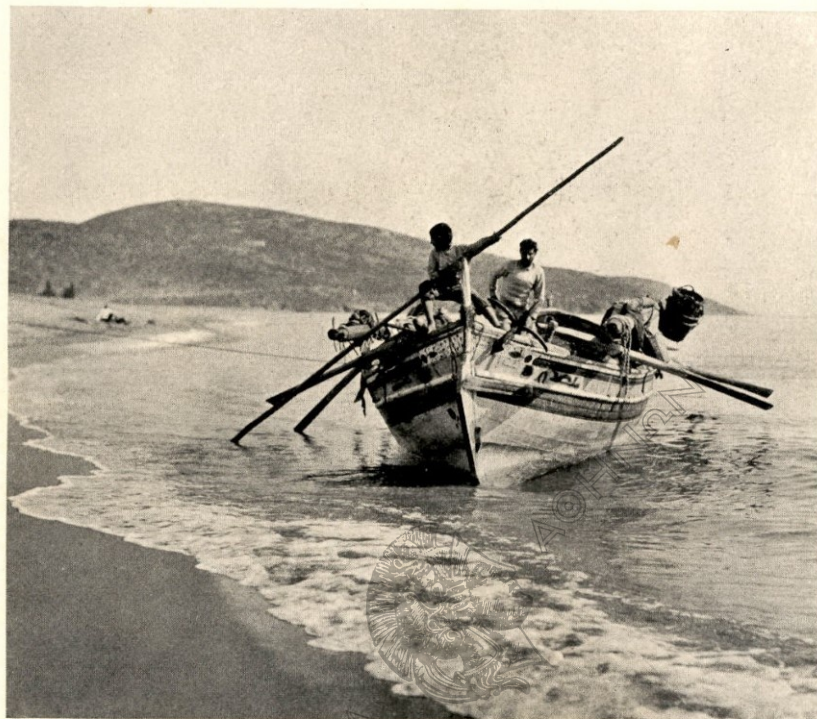
A STURDY FISHING BOAT NEAR KAVALLA

Although Greece has a long coastline and the large number of fast days causes a great demand for "meat without blood," the fisheries are not highly developed. Refugee fishermen from Asia Minor are introducing improved methods and equipment.