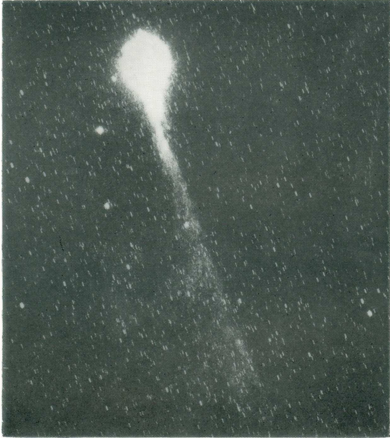
Fig. 3. Comet Halley.